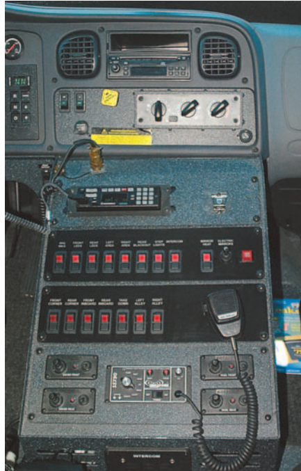
The BEAR's console is pretty straightforward with the usual radio, siren and light-bar controls, and various lighting switches.