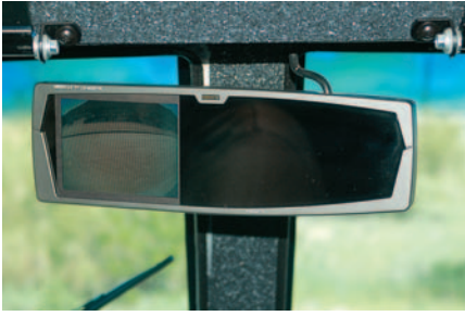
The rear-view mirror features a video screen linked to a rear-facing camera.

options include the front-mounted battering ram, infrared cameras, roof light bars, radiation protection packages, explosive gas detection systems and on-board SCBA to allow personnel to breathe clean, compressed air in hazardous situations.