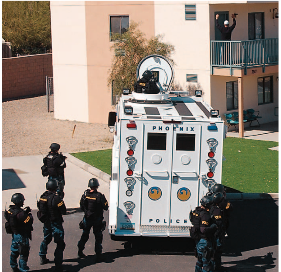
The Phoenix Police Department's special-assignments unit had a need for a new tactical vehicle.